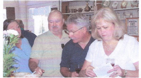
The Wine-and-Cheese Tasting was a huge hit.

Pioneer Oil Days - 2007: The weather was perfect, and the weekend was wonderful for the NYSOPA Wall OF Fame inductions, the parade, & the Wine-and-Cheese Tasting .