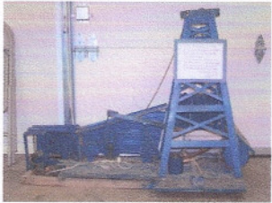
This model was a recent donation to the museum.