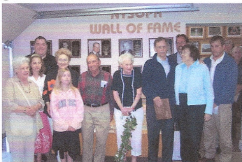
Members of the Barry, Bucher, Schaffner, and Walchli families gather to enjoy the Wall of Fame inductions.

Those in attendance for the Wall of Fame induction ceremony are invited to stay and participate in the Wine-and-Cheese Tasting as well as tour the museum. Spend some time touring the museum to learn about the amazing heritage of the local oil fields.