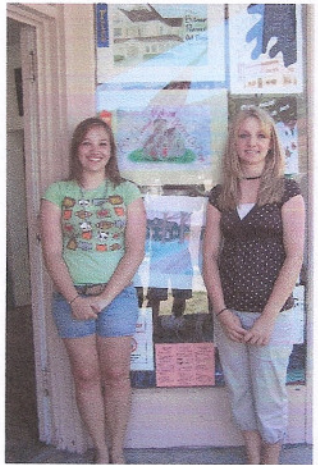
Two of the winners of the Pioneer Oil Days poster contest.